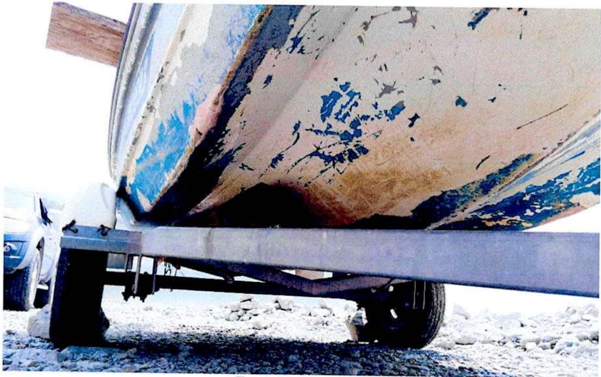
Front Bottom View